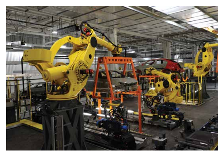
Robotic assembly lines can build cars, computers, and other things that you use in everyday life.

Robots can be operated by remote control (known as teleoperated robots ), automatically by themselves (known as autonomous robots ), or a combination of teleoperated and autonomous operation (known as hybrid robots ). Robots have become more popular over time because they are able to perform very repetitive tasks or very dangerous tasks in the place of humans.