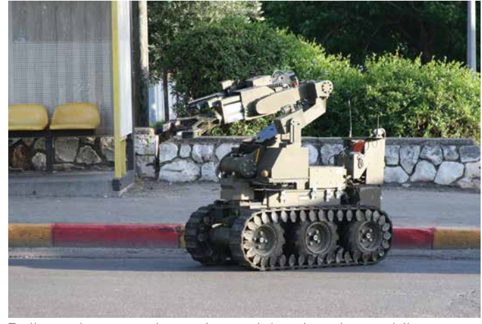
Police robots can investigate risky situations while human officers control them from a safe distance.