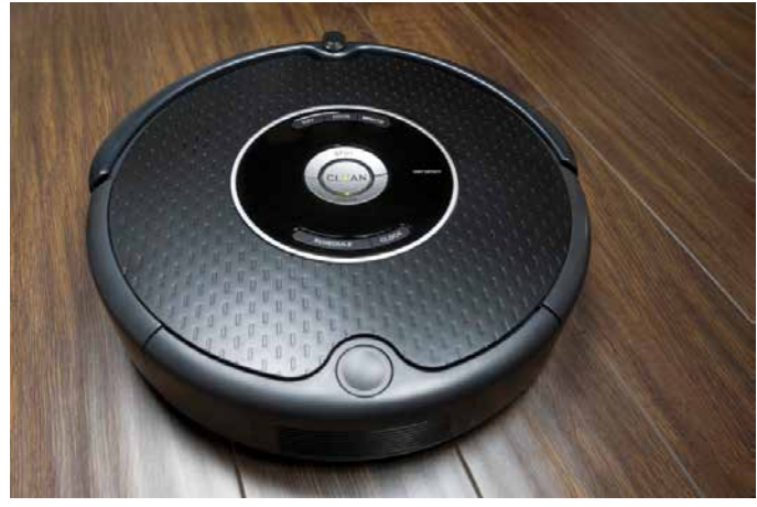
Service robots can clean your floor, mow the lawn, or assist those with disabilities.