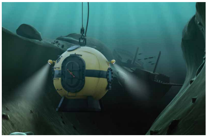
Deep sea robots crawl on the ocean's floor, discovering new life that thrives nearly six miles under water.